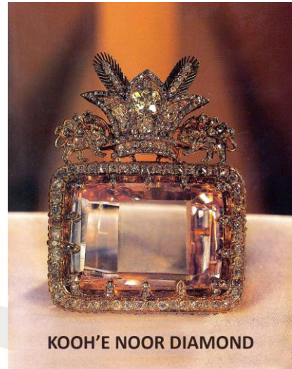
KOOH'E NOOR DIAMOND

Tehran, the Iranian capital, serves as a pit-stop for tourists whose itinerary takes them around the country. While some spend only a few hours in Tehran, many tour the city for a couple of days before heading to other destinations.